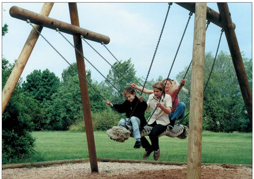
... for our children

The level of compliance with legal standards to date far exceeds the legal minimum requirements. The success that goes with the reaching this level adds impetus and motivation and obligation to continue on the chosen path. Out of respect for our employees, customers and the environment, we will continue to critically evaluate our corporate goals, products and activities. Our technical know-how makes us a qualified partner for our customers. Honesty and openness allow us to develop continuously at a personal, technical and corporate level. This, we believe, is a valuable contribution for tomorrow's world.